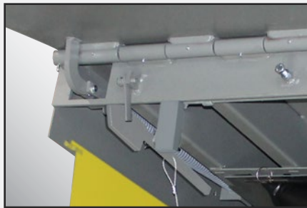
Unique lip latching mechanism provides positive, full height lip extension.