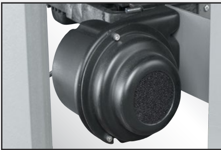
High volume, low pressure air blower to efficiently raise the leveler.