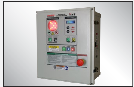
Optional iDock® Controls with online connection to myQ® Enterprise.