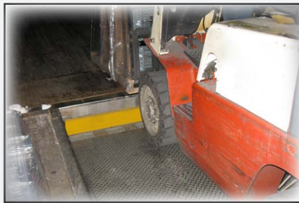
The barrier is designed to allow for end-loading at the loading dock.