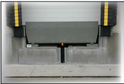
Add the Barrier Lip and combine with vehicle restraints for optimal safety.