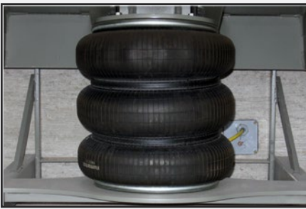
Steel belted rubber bellows system uses compressed air to raise platform.