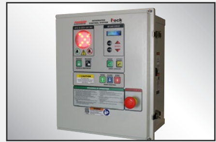
Optional iDock® Controls with online connection to myQ® Enterprise.