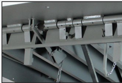
The Lip Drive positive lip extension reliably extends the leveler's lip and restricts its descent until walk-down is performed.