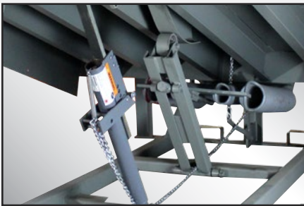
Cam Control Counter Balance Assembly permits smooth ramp extension and easy walk-down of the leveler.