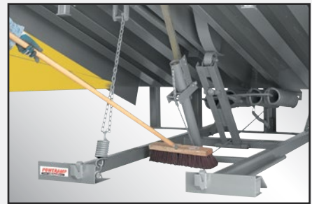
CleanSweep Frame allows unobstructed access to the pit area.