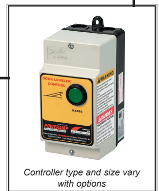
Controller type and size vary with options