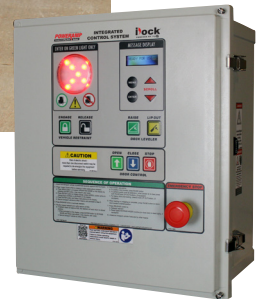
Integrated Control Panel Shown (Size varies with options)