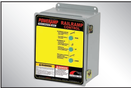
Constant pressure up, down and lip buttons provide continuous control to the operator.