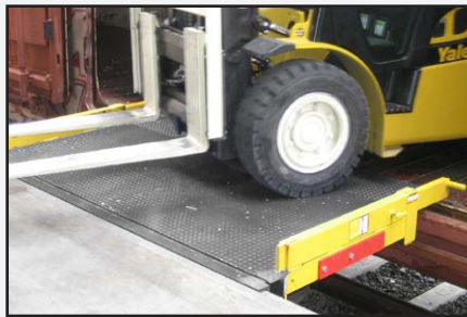
Standard yellow run-off guards to help prevent a forklift truck from driving off the edge.