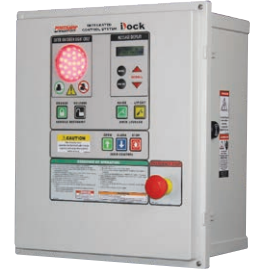
Integrated Control Panel Shown (Size varies with options)

WARRANTY: All PowerHook vehicle restraints feature a full two (2) year base warranty on all structural, hydraulic and electrical parts, including freight and labor charges in accordance with Systems, LLC's Standard Warranty Policy. Structural and hydraulic components carry an additional full three (3) year extended warranty with parts and labor. Systems, LLC warrants all components to be free of defects in materials and workmanship, under normal use, during the warranty period. This base warranty period begins upon the completion of installation or the sixtieth (60th) day after shipment, whichever is earlier.