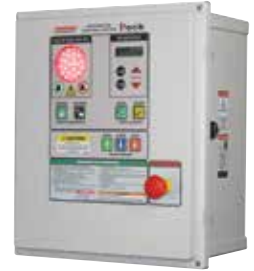
Integrated Control Panel Shown (Size varies with options)

Please Note: Unless specifically noted on quotation, all electrical requirements, including mounting of control box, outside lights and signs, are the responsibility of others.