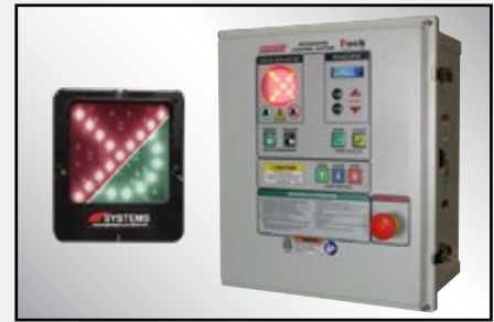
iDock® Controls includes light communication and can be integrated with other dock equipment.