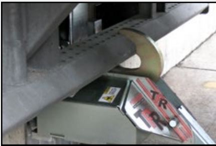
The TPR® hook rotates up to engage the RIG and secure the trailer to the loading dock.