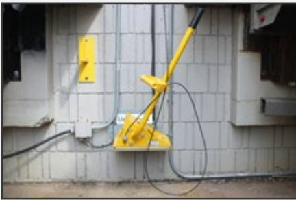
Easily stored and away from damage or debris.