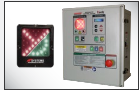
UniChock includes light communication and can be integrated with other dock equipment.