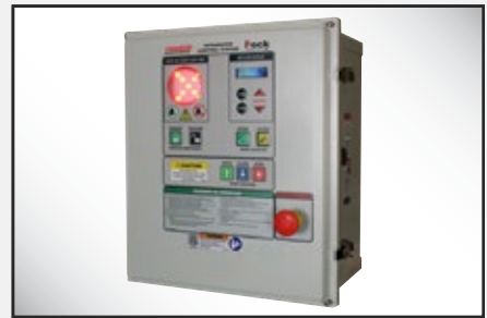
Optional iDock® Controls with online connection to myQ® Enterprise.