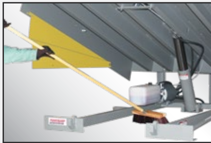
CleanSweep Frame Design.