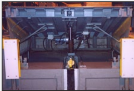
Automatic positioning bumpers eliminate interference with pit walls.