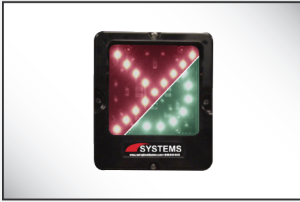
Exterior lights are standard with LED for extended life. One light shows a red X and a green circle for color-impaired individuals.