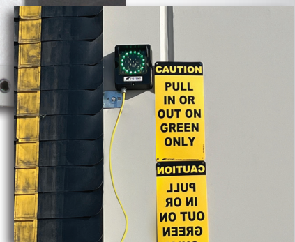
* iDock Alert controls shown with optional dock light button.