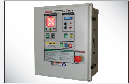
Upgrade to iDock® Controls with optional integrated equipment for a more efficient loading dock.

The iDock Alert Light Communication System is an enhanced version of Poweramp's simple Dock Alert and provides a reliable warning system that establishes a clear line of communication between truck drivers and dock personnel, thereby reducing the risk of accidents at the loading dock.